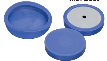
Magnet with Boot

Ideal for protecting painted, plated, polished, etc. surfaces from scratches. Boots also increase resistance to shear forces. Rubber boots fit over the magnetic face of cup magnets. Note: Using a rubber boot on a cup magnet will reduce the magnet's holding power due to air gap. See holding power below.