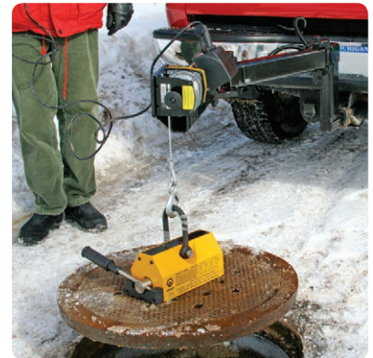
Pictured Right: Optional Front Bumper Adaptor (MCLBA12) for C-Channel bumpers