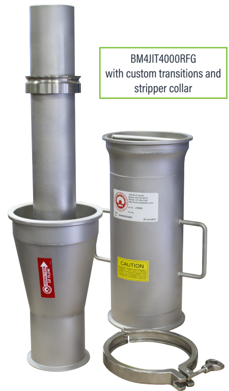
BM4JIT400RFG with custom transitions and stripper collar

Captured metal is cleaned by removing the clamp, to separate the two halves, allowing the operator to wipe the metal off the magnet with a gloved hand or shop rag. An EZ-Clean Stripper Collar option allows for fast removal of collected tramp metal.