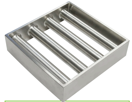
Rectangular Grate with Food Grade Construction (Fully Seam Welded and Polished)