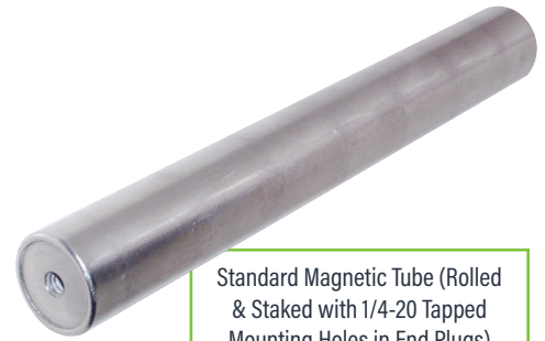
Standard Magnetic Tube (Rolled & Staked with 1/4-20 Tapped Mounting Holes in End Plugs)