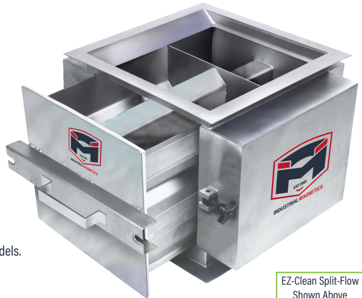
EZ-Clean Split-Flow Shown Above

The housing is constructed of all welded stainless steel for a long, noncorrosive life and is available in both EZ-Clean and Self-Cleaning models.