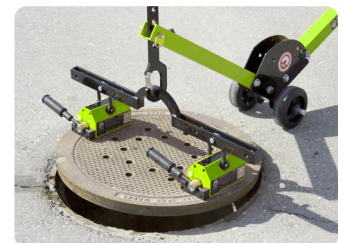
MCL3000W06 w/ MCL660X2