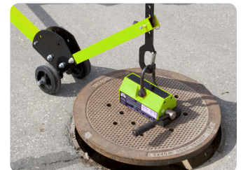
MCL3000W06 w/ PNL1600